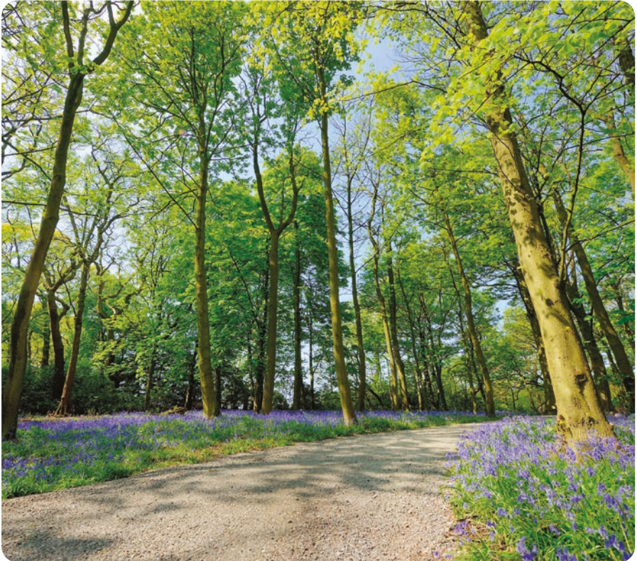
Bluebell Glade - GreenAcres Woodland Burials - Rainford

This could be either a traditional funeral, or an alternative one such as a natural burial in a woodland. To find out more, contact the cemeteries and crematorium department of your local council or the Natural Death Centre (see page 108).